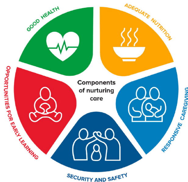
Fig. 1 Components of Nurturing Care for ECD

To mitigate this, potential cost efficiencies were realized through interventions being integrated into existing health and other sector platforms. MECP-U's approach in integrating playful parenting interventions involved: